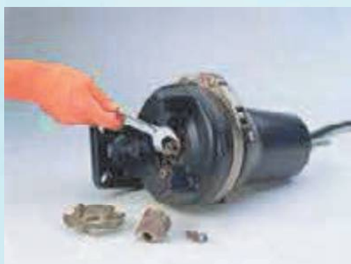
Highly effective grinder: Effective cutting by a highly reliable, patented grinder