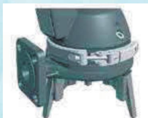
Three loose feet to be fitted to the pump housing for free-standing pumps